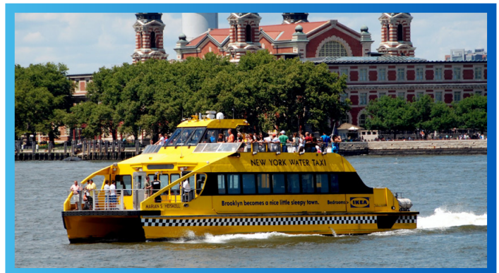
PM-50 PaintMask is great for stenciling watercrafts during marine paint applications on vessels of all sizes.

1524 very high tack | transparent film Protects graphics during die cutting and fabrication Adheres to both textured and smooth surfaces Tear resistant