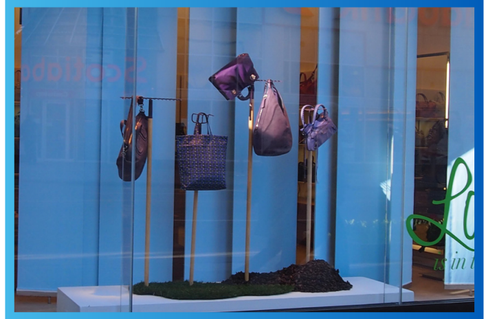
StencilRite 6932 offers a remarkable, cost-effective way to change painted temporary displays and backdrops in store fronts and on movie sets.

Heavyweight paper tape on a crepe liner Temporary wallpaper for movie set backdrops, designs, and displays, in addition to stencil applications Cost effective, time saving, and easy to dispose of Can be used for container markings Able to be steel rule die cut