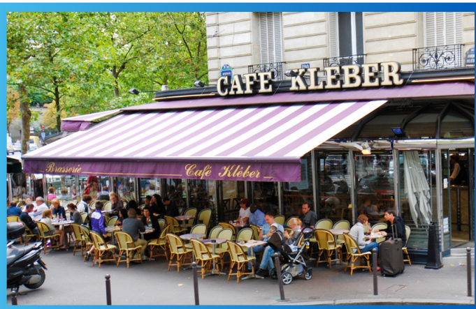
StencilRite 6932 and PaintMask PM-50 are two great options for stenciling designs on awnings, umbrellas, and other textiles.